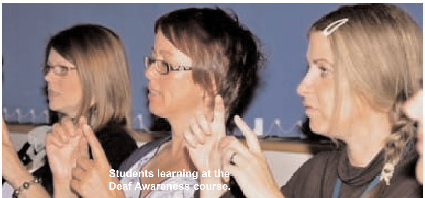
Students learning at the Deaf Awareness course.

To find out more, visit www.mylearningpool.com